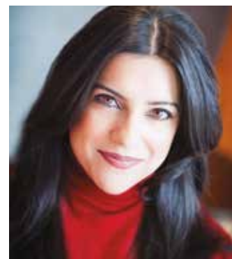
Reshma Saujani Founder/CEO Girls Who Code

How to Fail First, Fail Hard and Fail Fast